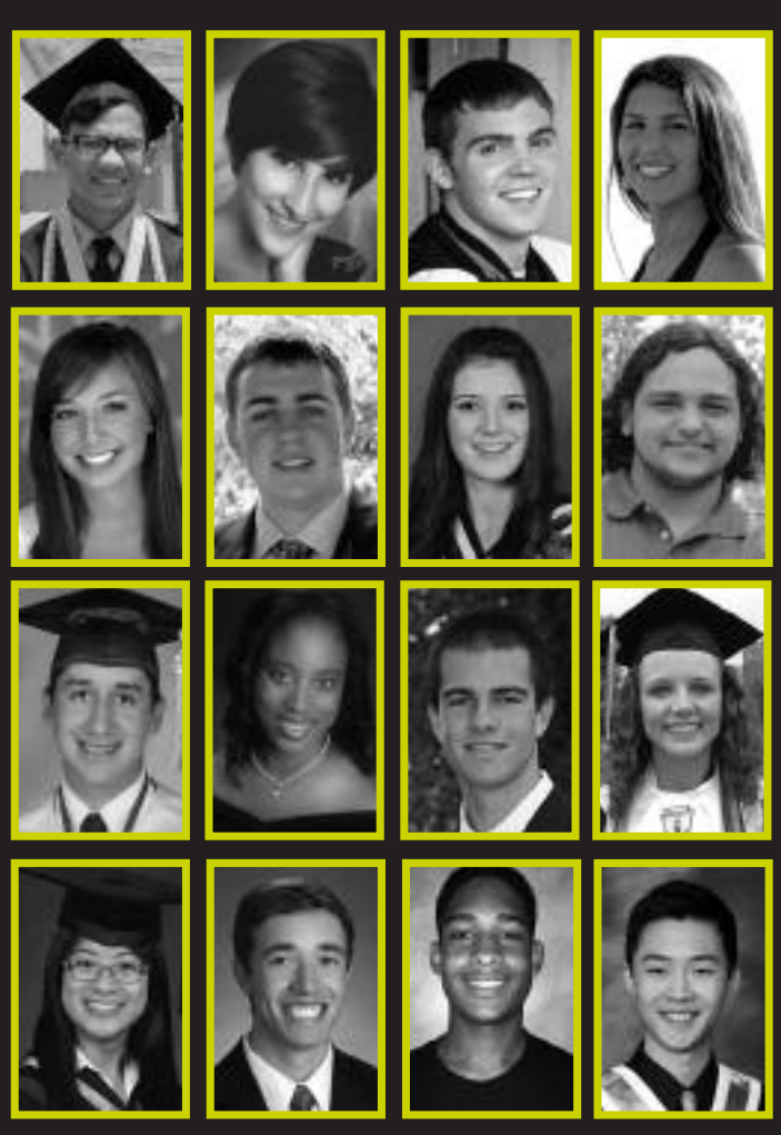
*More winners at www.teamster.org