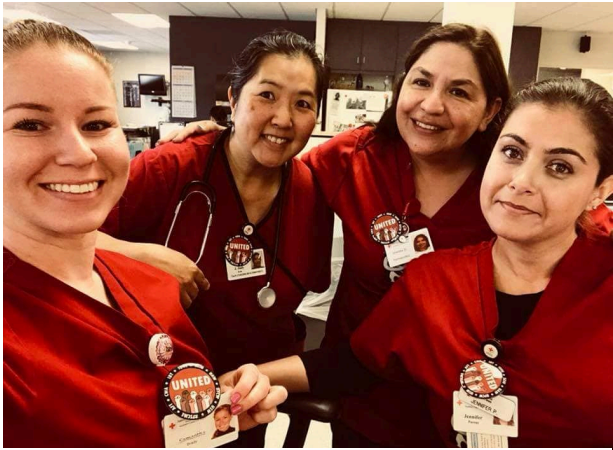
SEIU Local 721 * Southern California