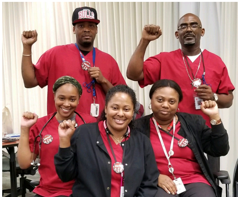
USW Local 254 * Georgia

Many Red Cross workers are not paid livable wages and it is a struggle to make ends meet. While the Red Cross responds effectively to the needs of disaster relief victims and provides other critical services, it oftentimes fails to address the basic needs of its employees who perform this work. We want to know more! Please take time to complete the survey link sent to you this week from your union. Remind your co-workers to complete the surveys. The Union bargaining committee and public relations team will collect and communicate your concerns.