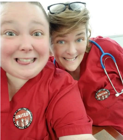
Teamsters Local 507 * Ohio