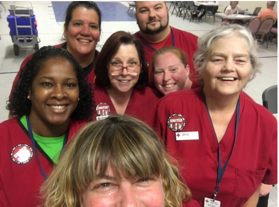
CWA Local 13500 * Pennsylvania