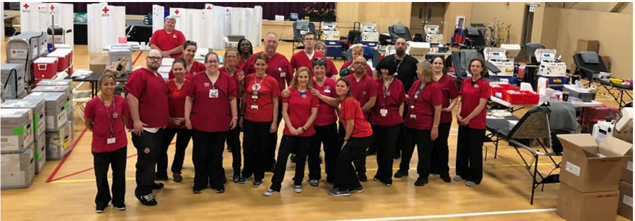
UAW Local 2322 * Massachusetts

We are wearing buttons to show Red Cross that we are paying attention to these negotiations and that we care about the outcomes.