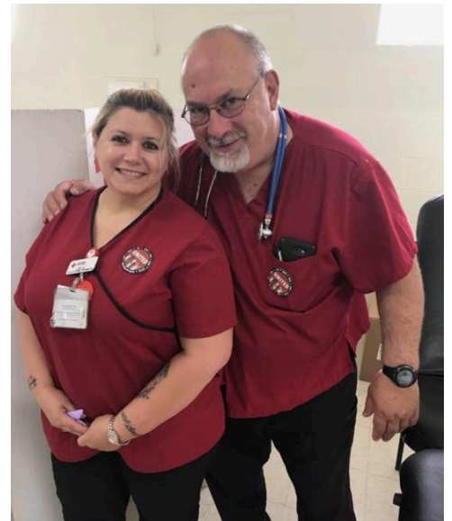
SEIU Local 1989 * Maine