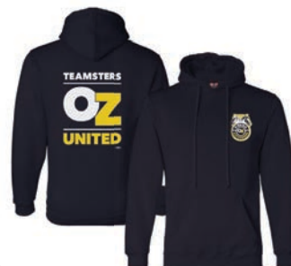
OZ Hooded Sweatshirt $75.00