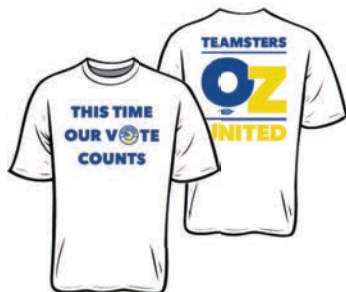
This Time Our Vote Counts T-Shirt $35.00